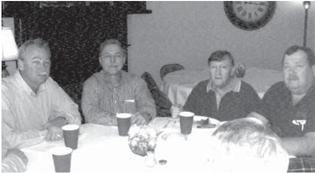
United Way Kick-Off dinner and meetings