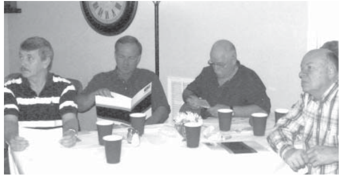
United Way Kick-Off dinner and meetings