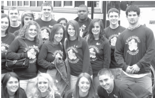
Twenty-two Blacksburg and Gaffney High School Juniors are participating in the Leadership Cherokee program sponsored by the Chamber of Commerce and the Hamrick Mills Foundation. The students visit area agencies and businesses learning about developing leadership skills.

May 23, 1911 – Anybody can work when everything goes smoothly, but a man must be made of the right kind of stuff who can rise above the things which annoy and handicap the weak and do his work in spite of them.