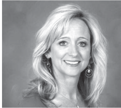
Kelly Galloway Corporate Office