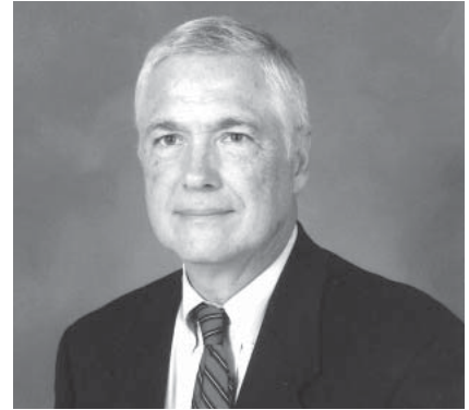
Carlisle Hamrick Corporate Office